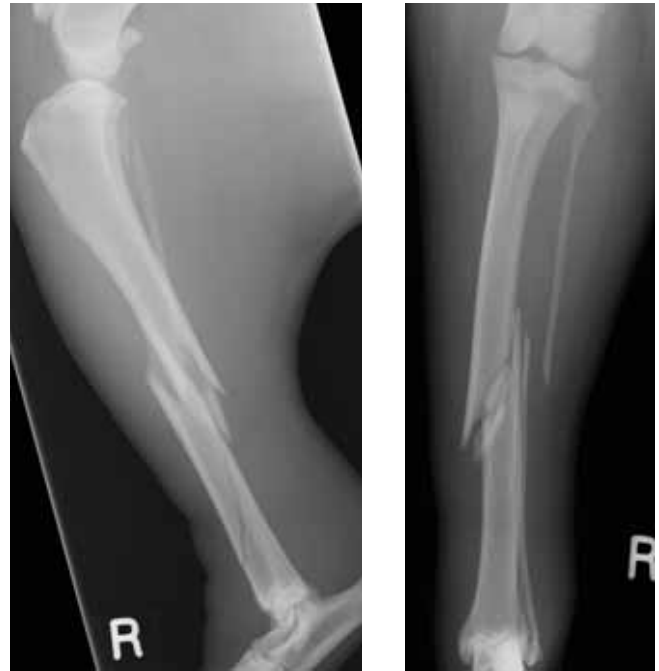
Figure 1: Mediolateral and craniocaudal radiographs of the comminuted, mid-diaphyseal fracture; use of DBM was planned to optimize bone healing.

This dog was involved in a road traffic accident and sustained a closed, comminuted fracture of the right tibial diaphysis with severe bruising of the soft tissues. There were no other significant injuries. The fracture was considered “reconstructable” (Figure 1) and neutralisation plate and screw fixation was planned. As is policy for all diaphyseal fractures in skeletally mature dogs, bone grafting of the fracture site was also planned.