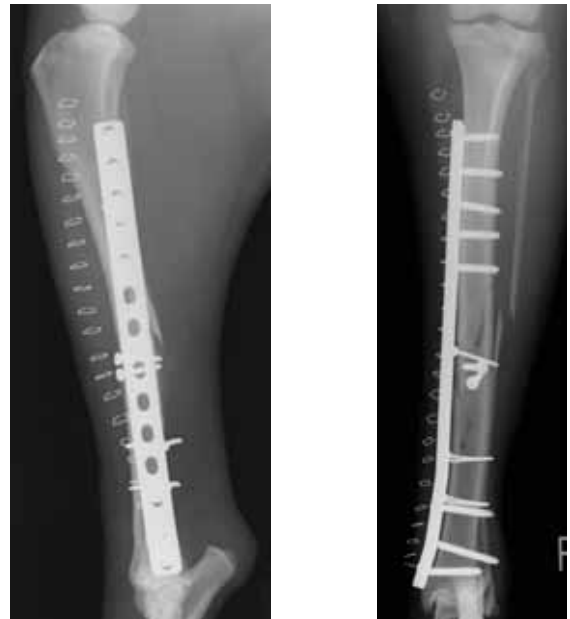
Figure 4: Immediate post-operative radiographs

Radiography revealed good fracture reduction and reconstruction with satisfactory placement of all implants (Figure 4). The dog was discharged with analgesics for the next 8 weeks. Initially this involved a combination of carprofen (Rimadyl, Pfizer) and paracetamol/codeine (Pardale V) for five days, with continued analgesia on carprofen only.