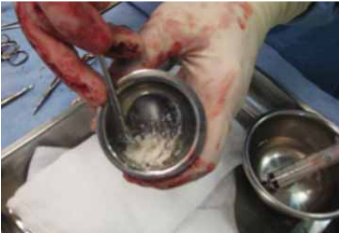
Figure 2: The DBM is rehydrated 10 minutes prior to intended use

A 3cc vial of Veterinary Tissue Bank Demineralised Bone Matrix (DBM) was opened and rehydrated (Figure 2).